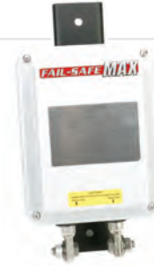
FAIL SAFE MAX™