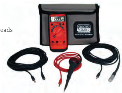
CORROSION TEST KIT