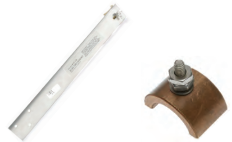
PROPELLER SHAFT BRUSH