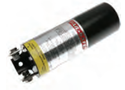
FAIL SAFE PLUS™