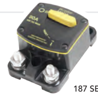
187 SERIES SURFACE MOUNT