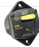
187 SERIES PANEL MOUNT