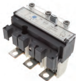
THERMAL MAG TRIP UNIT